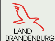
Dr. Dietmar Woidke Prime Minister of the Federal State of Brandenburg